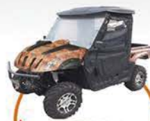
OPTIONAL 2 Enclosure