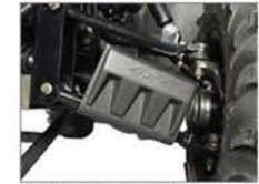
Mud Rock Guards each A-Arm