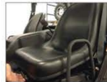
Comfort Adjustable Bucket Seats