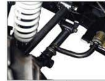
Rear Stabilizing Sway Bar