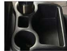
Dual Cup Holder with Beverage Caddy