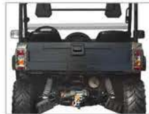
Pick-up truck style cargo door