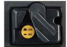
4X4 / 4X2 Switch