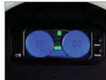
Multi Function Digital Instrument